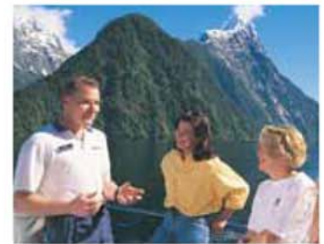
Our personable tour directors who will be accompanying you, work with our local guides and contacts to deliver our "promise of something special". Their job is to take care of everything so that you can relax and enjoy your HOLIDAY OF A LIFETIME.

Full details of the different HOLS, including day to day itineraries, can be found at www.goway.com/hol or in our respective DOWNUNDER, ASIA, AFRICA Experts and LATIN AMERICA brochures.