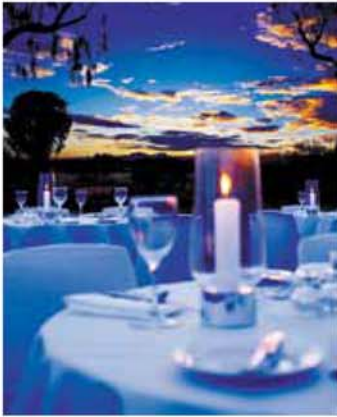
Enjoy unique dining experiences on any HOLIDAYS OF A LIFETIME. Above is the Outback Sounds of Silence Dinner in Australia.

It is not quite true, but the thinking of the Goway Operations Division is that "anyone can operate an escorted tour". So, continuing this thought "we do not want to be like everyone else". This culture was embedded in our original escorted experience back in 1983 and remains today in our different tours to the South Pacific, Asia, Africa and Latin America.